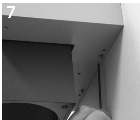
7 Secure fixture on under-side with hex wrench.