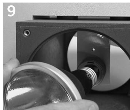
9 Install lamp per relamp label. Reinstall lamp coverplates.

Product to be installed by qualified electrician only.