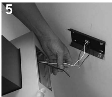
5 Make electrical connection.