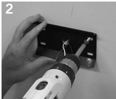
2 Attach mounting bracket to wall. NOTE: Fixture weighs approximately 15 lbs. Reinforce wall as required.