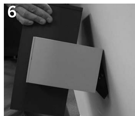
6 Hang top of fixture on bracket.