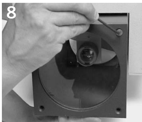
8 Remove lamp coverplates with hex wrench.