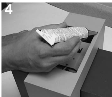
4 Line outside of back side fixture opening with clear silicone caulk.