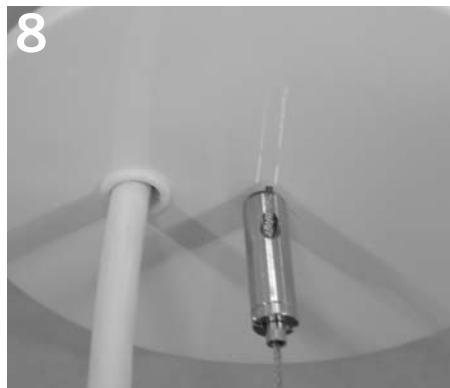
8 Insert cable and adjust to desired length. Trim excess cable. Repeat same steps at support point, without cord. Attach to 1/4-20 stud provided by contractor.

Note: Luminaires must be tied to structure per local requirements.