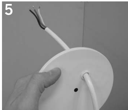
5 Thread feed cord through bushing in feed canopy.