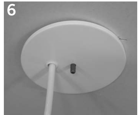
6 Make electrical connection in j-box and slide canopy over 1/4-20 stud.