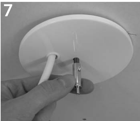
7 Secure canopy by tightening threaded cable gripper onto stud.