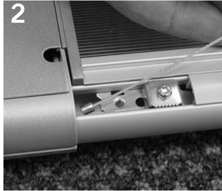
2 Position cable swedge underneath cable stop.