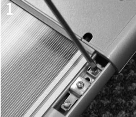
1 Unscrew cable stop at each end of fixture.